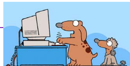
Hold on Ashley! Let me finish leaving a comment for Reggie and then you can e-mail back and forth to Kirby all day!!!