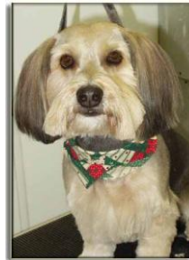
Figure 3 – Notice the dog's mouth is pulled forward

Though leashes can sometimes trigger an attack they are a handler's best friend. Just keeping the dog under physical control and occupied with tricks, or basic commands can prevent a huge amount of pain. When leashes create the most problems are when owners allow the dog to pull at the end of the leash toward another dog. Some dogs are more likely to appear aggressive due to their comfort in being restrained away from the target dog, as Carol Benjamin says “Like a held back drunk who says, 'Let me go and I'll rip him to pieces’” (76.) Pulling up hard on the leash also causes the dog to raise his head, appearing more dominant. In many dogs, it increases their frustration levels. As advocated by many trainers teaching bite work, restraining the dog will increase the dogs' agitation and increase their drive to bite. In this situation, the best solution is to move sideways away from the approaching dog. If your dog is the one pulling, turn and go the opposite way and get your dog to focus on you instead of the other dog.