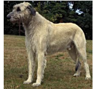
The Irish Wolfhound has a peaceful and quiet personality. He is affectionate and loves to be with people.