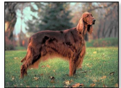
The Irish setter is noted for his personality. Typically Irish, he has a devil-may-care attitude and an undeniable sense of humor.