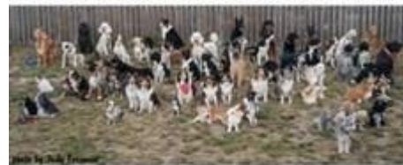
Where I come to sit and stay with my friends