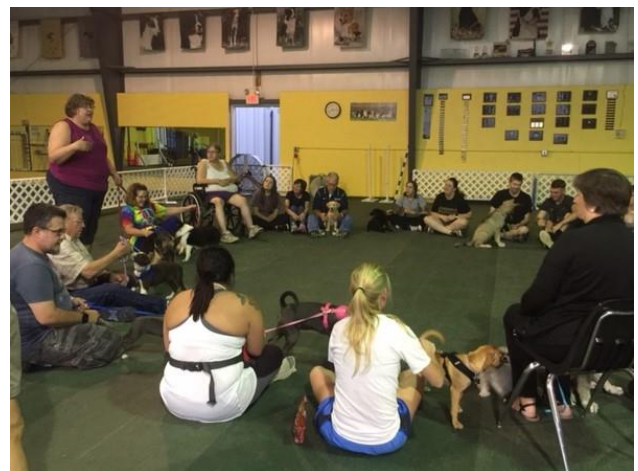
Playing Pass the Puppy.